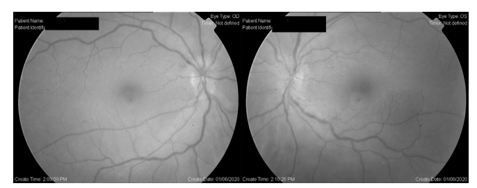
Figure 1: Fundus photography of right and left eyes at presentation showing swollen optic disc as a sign of papillitis.