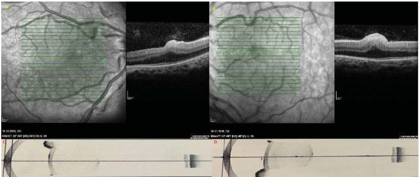
Figure 2. Posterior segment OCT scan shows papillomacular folds with the SPECTRALIS® OCT (Heidelberg Engineering) A: right eye B: left eye; and full length longitudinal cut with the Zeiss IOLMaster® 700.