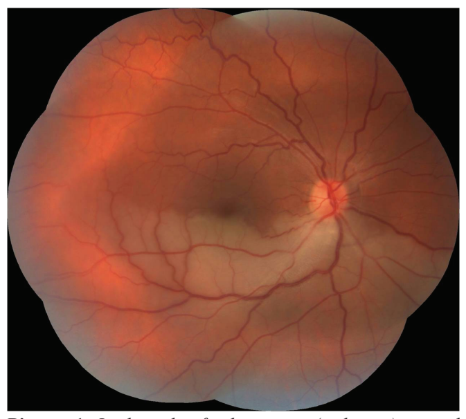
Picture 1. In the color fundus image (right eye), retinal artery branch occlusion that involves inferior part of eye is seen. It is seen that retina was whiten at areas compatible to trace of occluded artery and superior part of fovea was spared.

Any condition that impairs blood flow in retinal arteries can lead retinal artery occlusion. However, the most common cause is embolus from internal carotid artery or heart in CRAO and BRAO (non-arteritic CRAO and