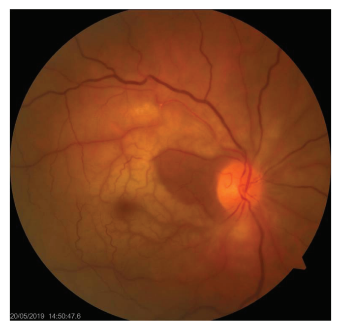
Picture 2. In the color fundus image (right eye), central retinal artery occlusion accompanied by cilioretinal artery is seen.

BRAO) (Picture 3). Blood dyscrasias that cause hypercoagulation and vasculitis are less commonly involved in the etiology. The giant cell vasculitis in a cause of arteritic CRAO.<sup>5-8</sup> The incidence of non-arteritic CRAO is 1-2: 100,000 but it is increased by advancing age and reaches up to 10: 100,000 in 80 years of age.<sup>9,10</sup> In patients with CRAO, the frequency of cardiovascular risk factors such as hypertension, atherosclerosis and diabetes mellitus