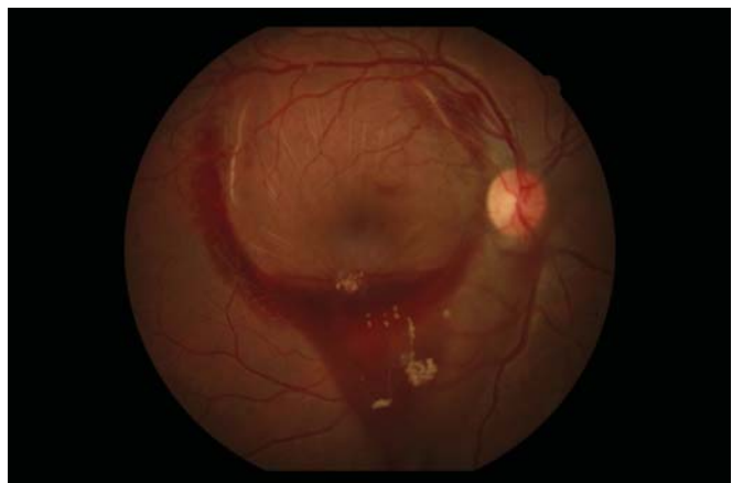
Fig. 3: Picture of the first post treatment day.