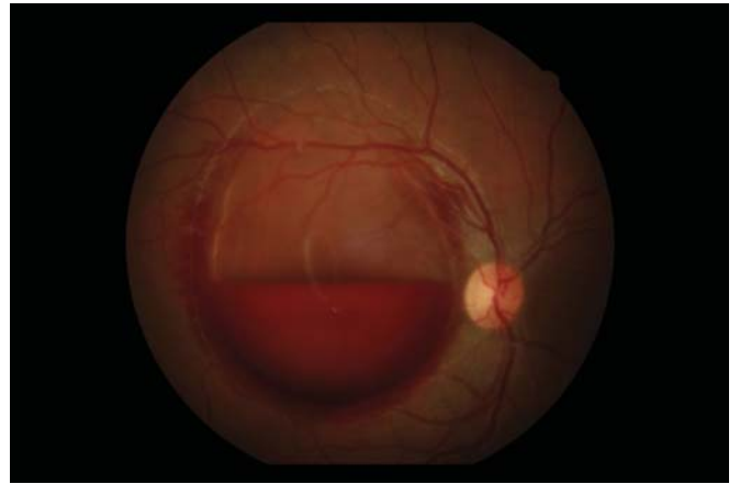
Fig. 1: Pre treatment picture.

Valsalva retinopathy may cause preretinal hemorrhage and early treatment allows more rapid visualization as in my case. 11-12 Treatment modalities include observation of small and extrafoveal hemorrhages, vitrectomy for refractory and longstanding cases, intravitreal gas and tissue plasminogen activator (TPA) injection and Nd:YAG or Argon laser hyaloidotomy. Nd:YAG laser hyaloidotomy is used for subhyaloid drainage in many cases in literature with energy levels ranging from 2.5 to 50 mJ with relatively good success. 13 It is designed for anterior segment and in shallow subhyaloid hemorrhages it may cause damage to the retina. Due to its potential damage, it has been emphasized that Nd:YAG therapy can only be used in premacular hemorrhages at least 3 disc diameters in size. 14 Early vitrectomy can be also the choice of treatment but after that procedure recovery time is longer than the patients with Nd:YAG or Argon laser hyaloidotomy. There are many intra and postoperative complications of vitrectomy than laser. 15 TPA has been successfully used with intraocular